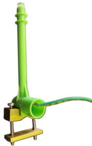
1 X BOND POINT